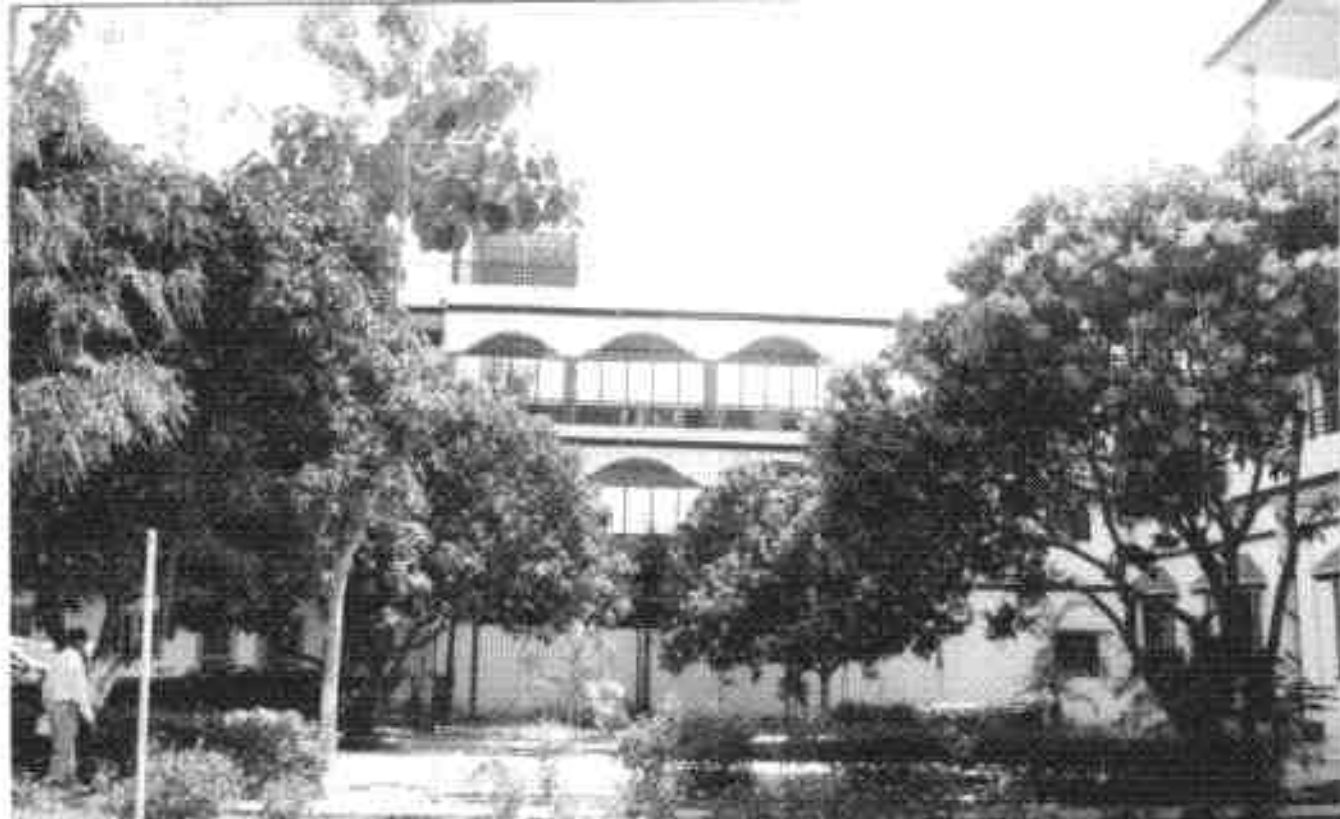
Encl 8(b): Girls' Hostel