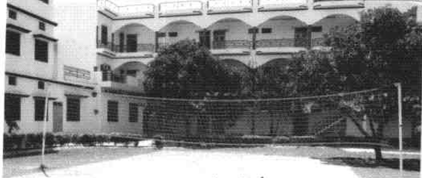
Encl 8(a) : Boys Hostel